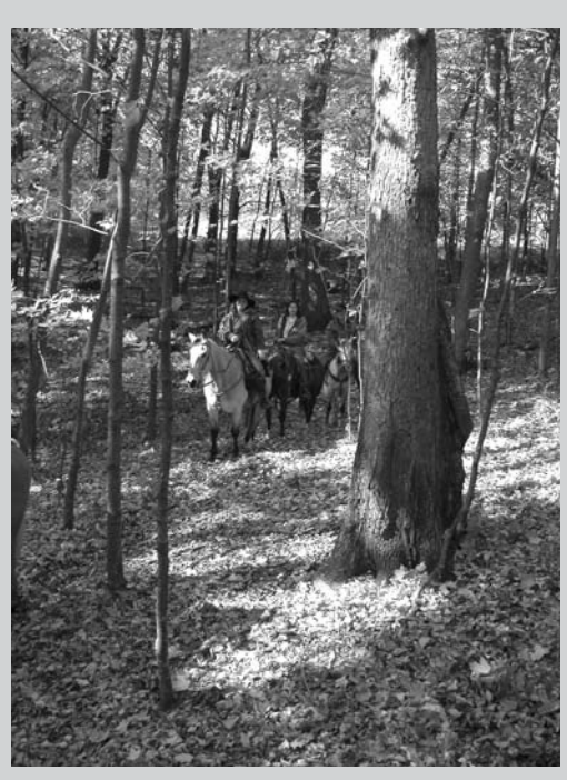
Left photo: Clemson forest riders. Right photo: Wisconsin suger maple ride.

user safety and environmental protection, usually by statutory mandate.