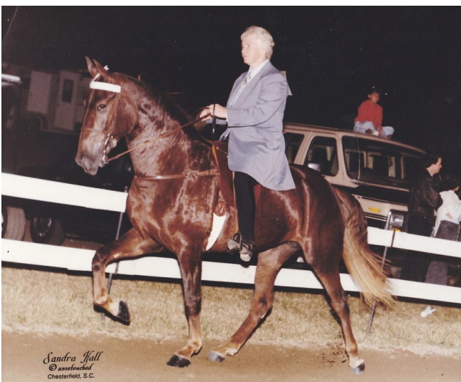
Whips' Wayward Lass showing at Lexington, SC Horse Show in 1999