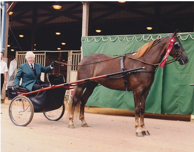
Whips' Wayward Lass winning Reserve Champion at Murfreesboro, TN completing her points for Supreme Champion in 1993