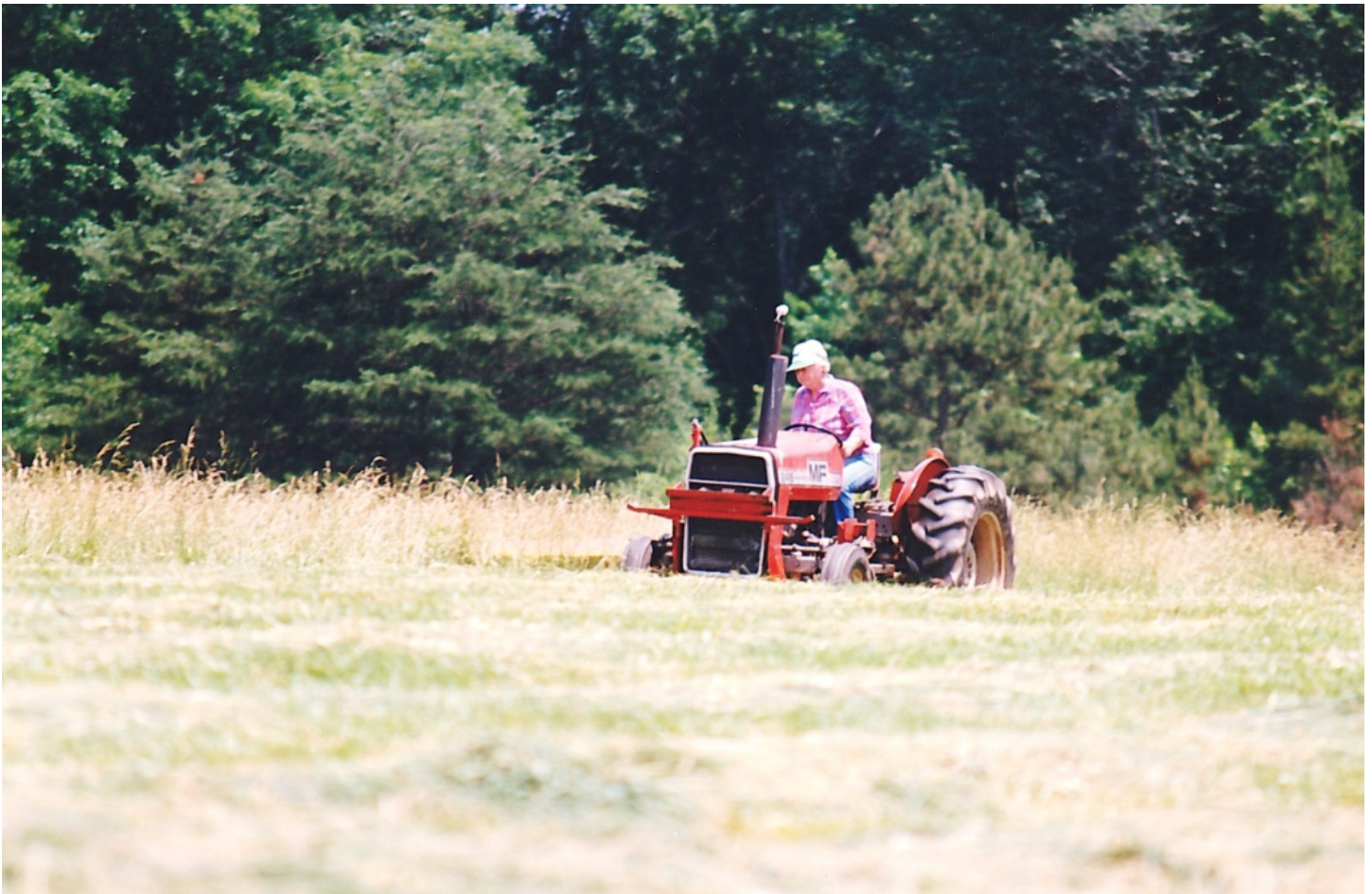
Haying time at Shady Acres Farm